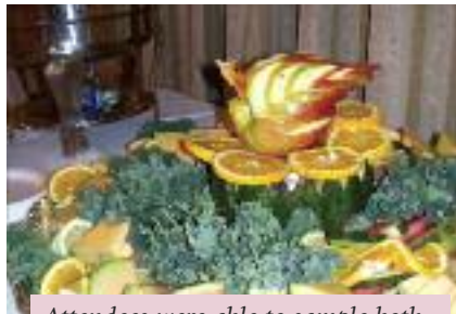
Attendees were able to sample both Indian and American cuisine!