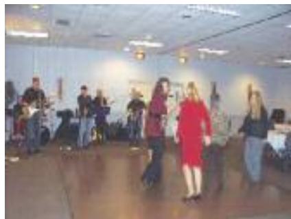
The crowd enjoys the festivities and dancing to MedRock!