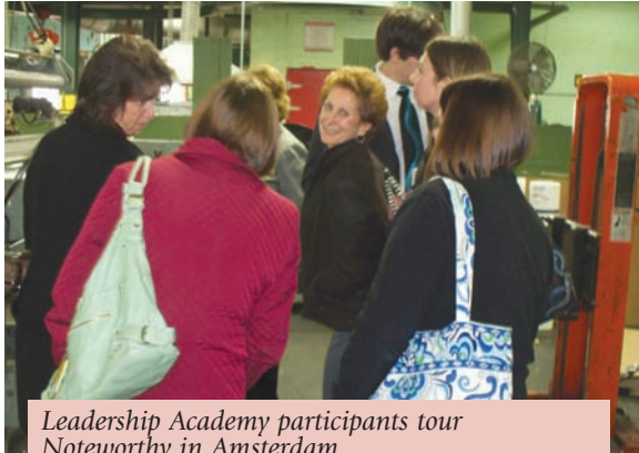
Leadership Academy participants tour Noteworthy in Amsterdam