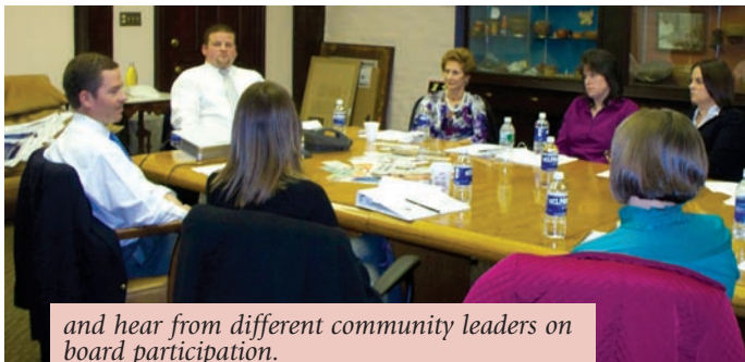
and hear from different community leaders on board participation.