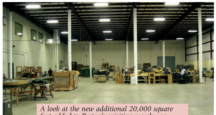
A look at the new additional 20,000 square feet added to Breton's existing warehouse