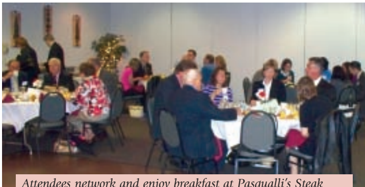
Attendees network and enjoy breakfast at Pasqualli's Steak House at the America's Best Value Inn.