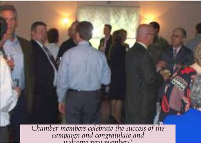
Chamber members celebrate the success of the campaign and congratulate and welcome new members!