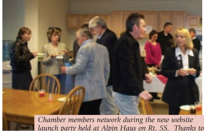
Chamber members network during the new website launch party held at Alpin Haus on Rt. 5S. Thanks to Alpin Haus for hosting the event and thanks to Charlie's for catering the event!