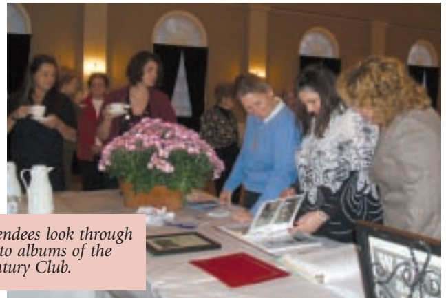
Attendees look through photo albums of the Century Club.