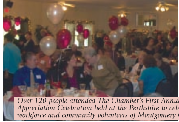
Over 120 people attended The Chamber's First Annual VIP Appreciation Celebration held at the Perthshire to celebrate the workforce and community volunteers of Montgomery County!