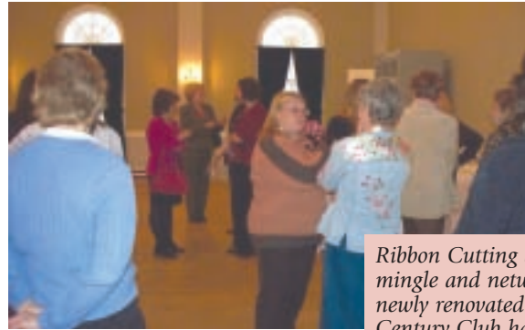
Ribbon cutting attendees mingle and network in the newly renovated GFWC Century Club hall.