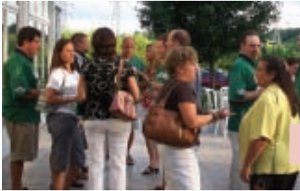
Attendees mingle at River Stone Manor.