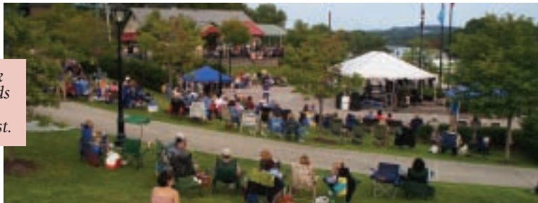
People gather at Riverlink Park listening to the bands and waiting for the fireworks during Canalfest.