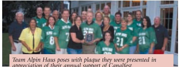
Team Alpin Haus poses with plaque they were presented in appreciation of their annual support of Canalfest.